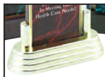
Optional Gold Pedestal Base