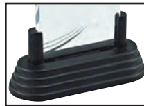
Optional Black Pedestal Base