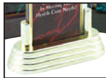
Optional Gold Pedestal Base