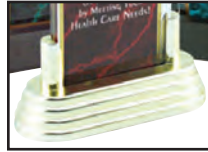
Optional Gold Pedestal Base